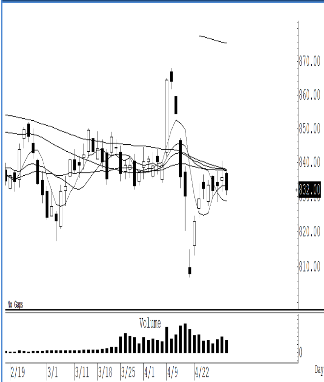
S50M24 (Close 832.0 Chg -1.20)